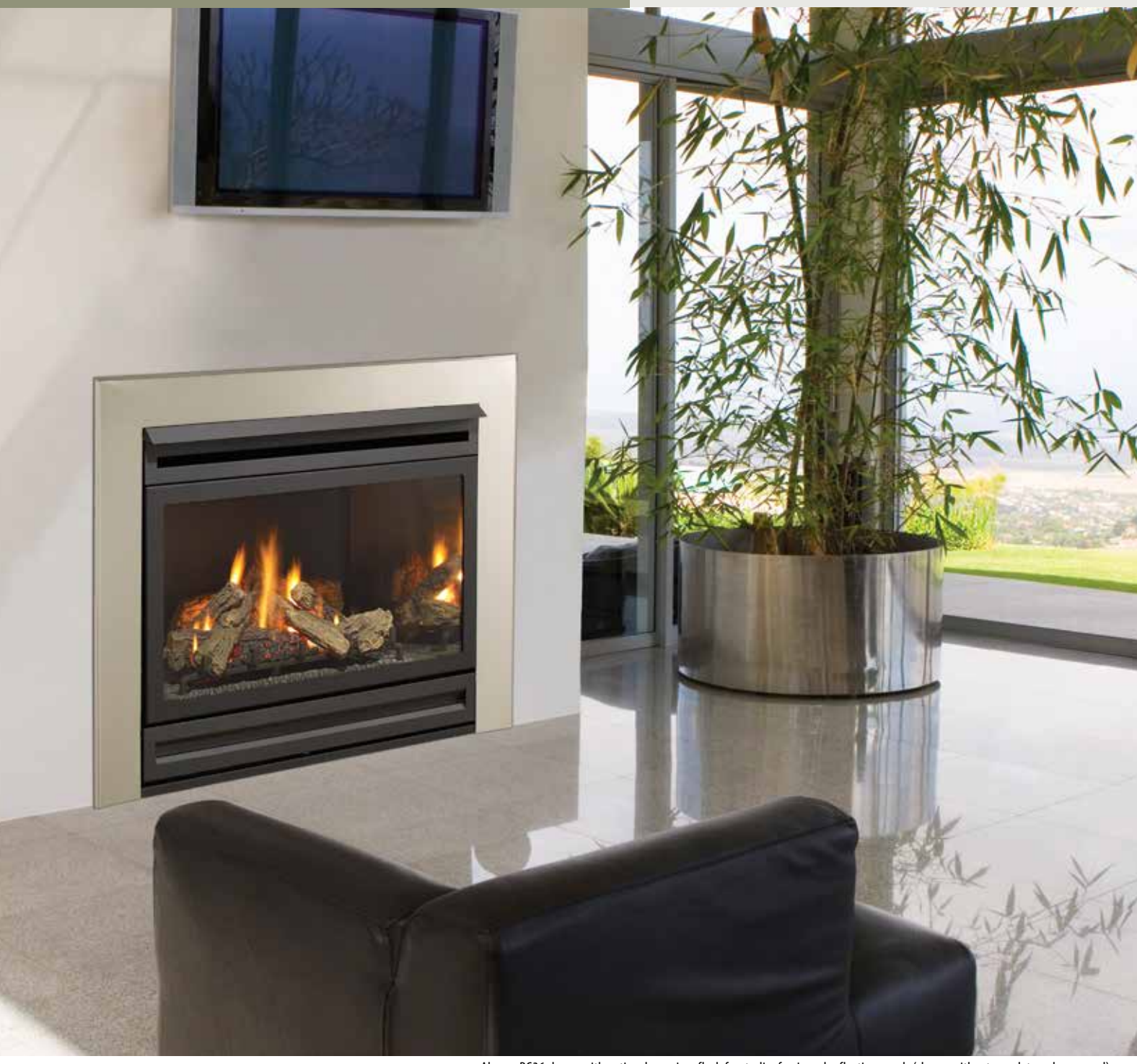
Above: PG36 shown with optional premium flush front, slim fascia and reflective panels (shown without mandatory dress guard).