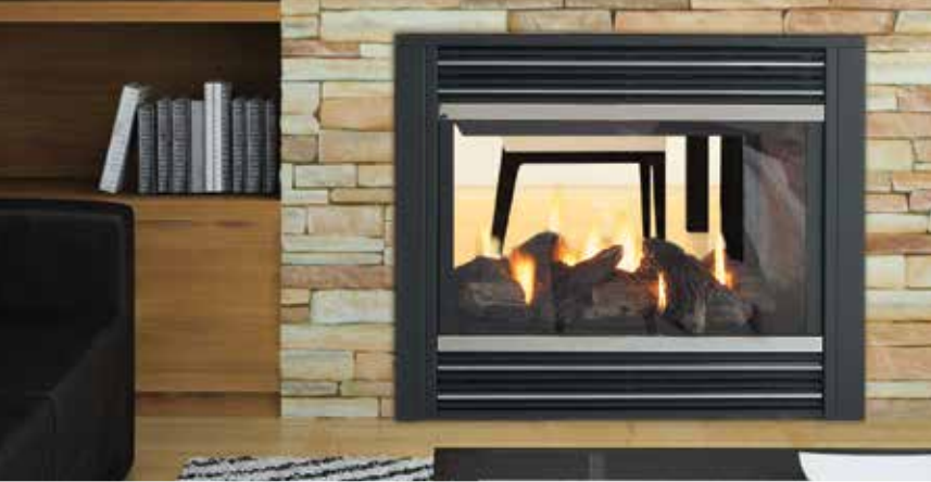
PG121 shown with optional steel louvres*, steel front trim* and old town red bricks.